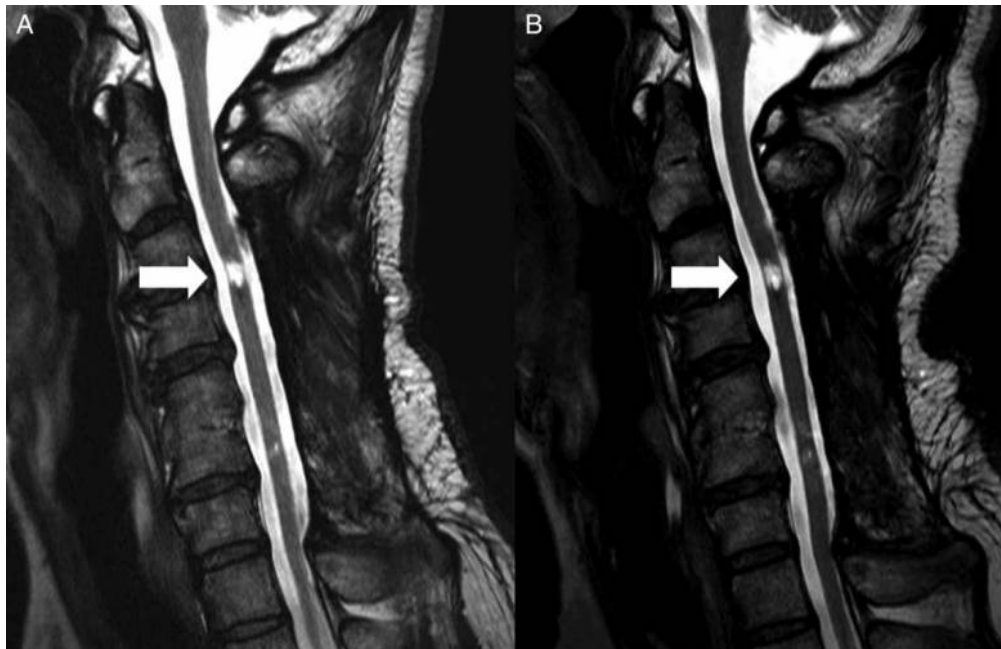
Figure 1 T2 sagittal MR image of patient 14. There was no interval change between baseline (A) and 8 months after transplantation (B).

et al. 9 reported BMDSCs intrathecal injection with 5 \times 10^6 to 10 \times 10^6 cells every month for 6 months. In summary, the dosage for each injection varied from